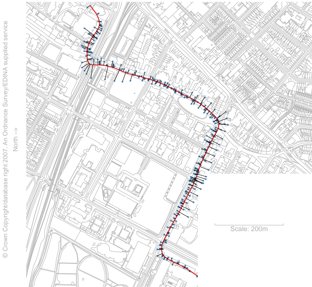
Figure 2: Principal curve (red) fitted to GPS point cloud data.