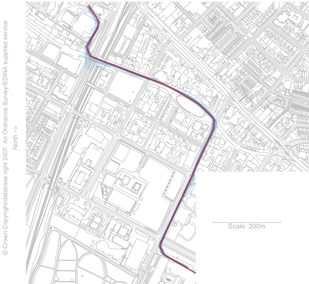
Figure 5: A Generalized principal curve (red) and its bootstrap sampling variability estimate (blue).