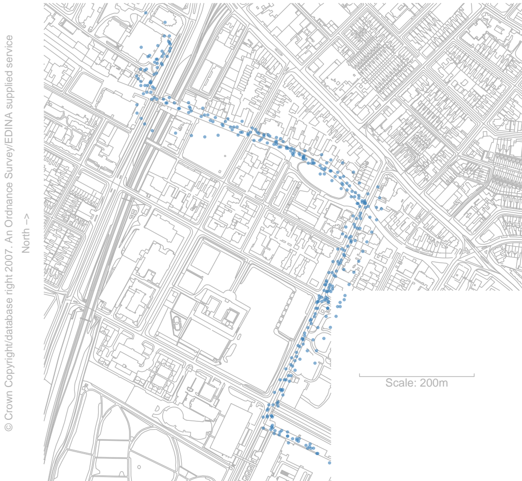
Figure 1: A point cloud showing recorded GPS tracks in Leicester.