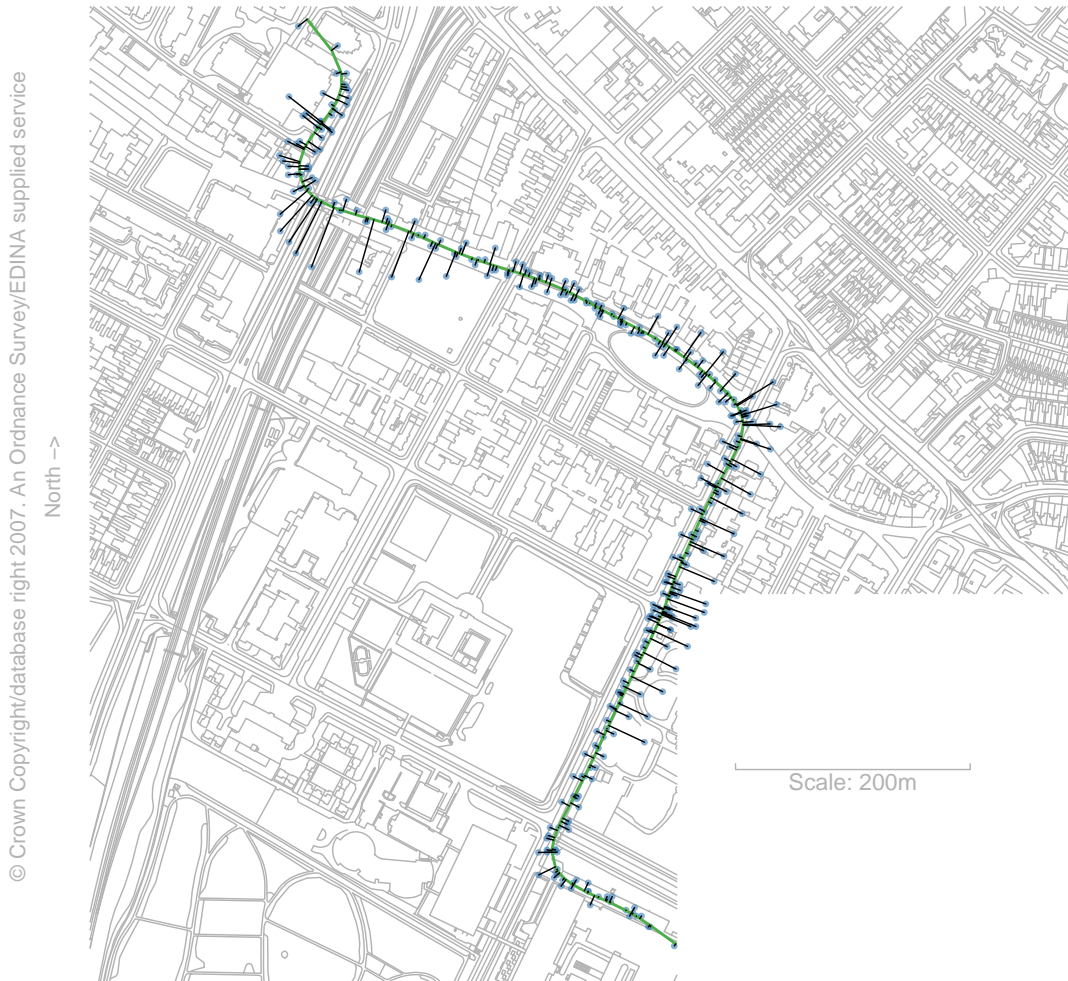
Figure 3: Robust principal curve (green) fitted to GPS point cloud data.