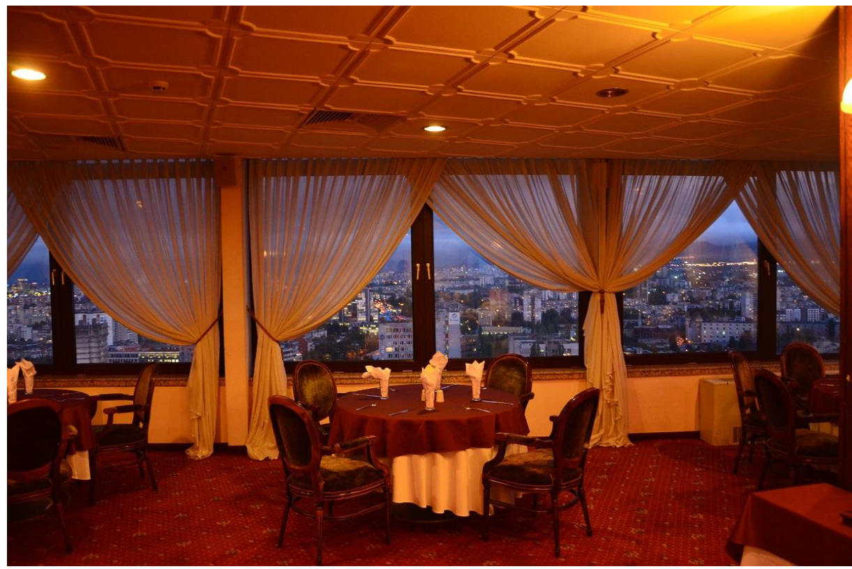
Sofia at nightfall