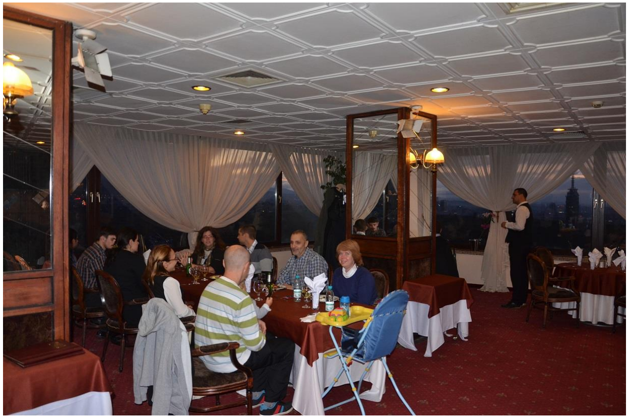
During the dinner