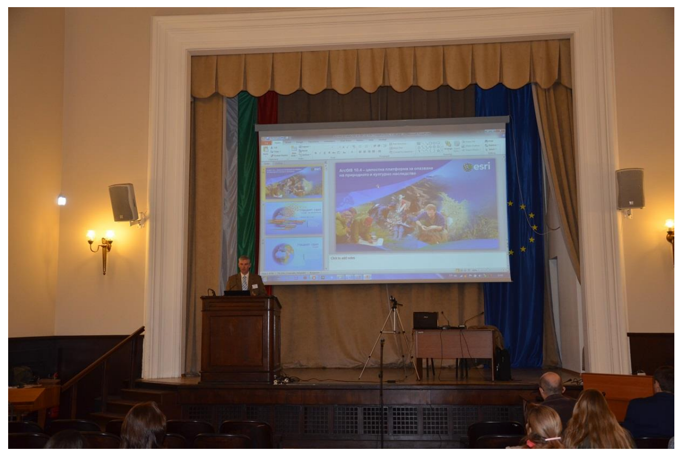
Technical Session of ESRI Bulgaria, presented by Dimitar Koritarov