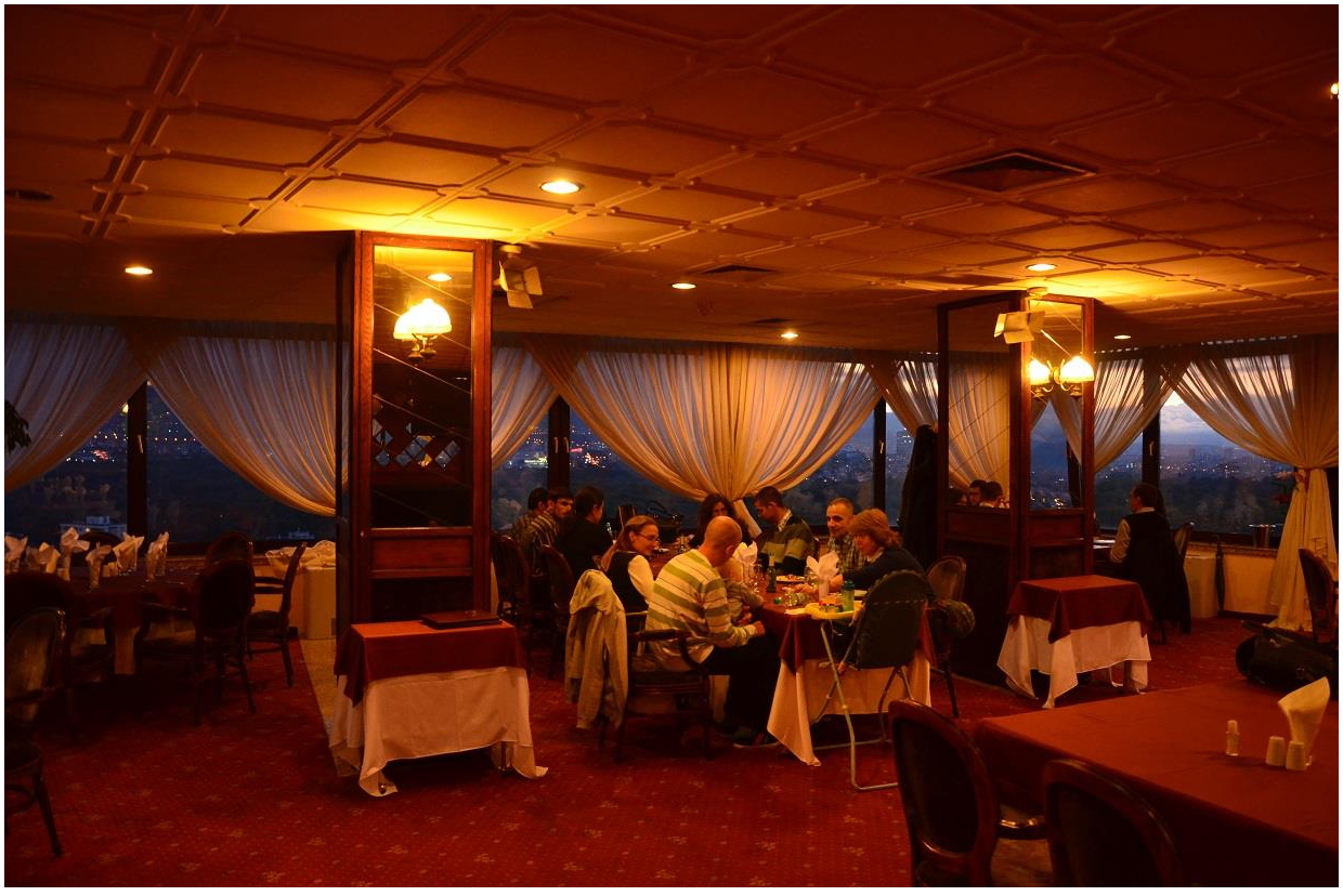
During the dinner