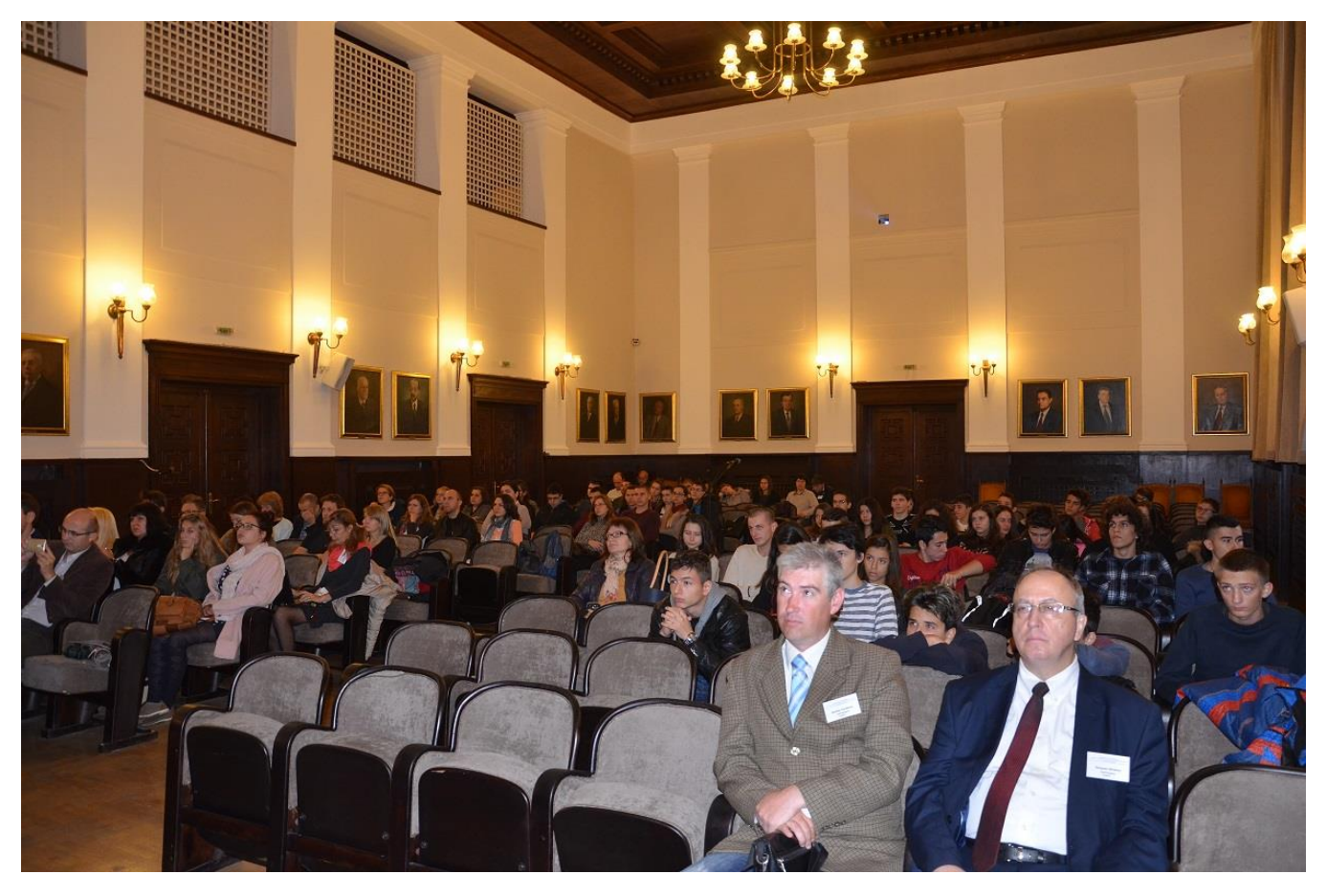
The Great hall of the Bulgarian Academy of Sciences

Conference opening took place on 11<sup>th</sup> of October at the Great Hall of the Bulgarian Academy of Sciences, followed by the plenary and technical sessions. The conference was attended by scientists and specialists from different institutes and universities in Bulgaria and abroad, students from Faculty of Geology and Geomorphology of the Sofia University "St. Kliment Ohridski "and pupils from the First English Language School, 19 High School" Elin Pelin "and National High School of Mathematics and Science "Acad. Chakalov."