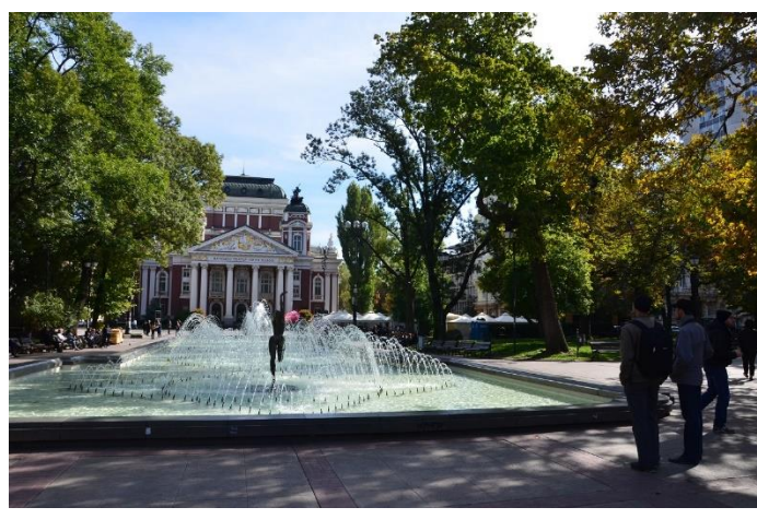
National theatre "Ivan Vazov"