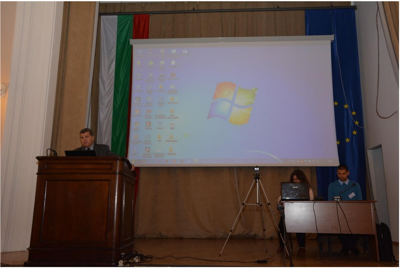
The Scientific secretary of Space Research and Technology Institute – BAS (SRTI-BAS) welcomed the conference participants and attendees and presented the SRTI-BAS activities.