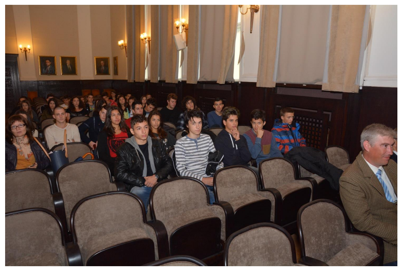
Conference attendees and pupils from 19<sup>th</sup> High School "Elin Pelin" and National High School of Mathematics and Science