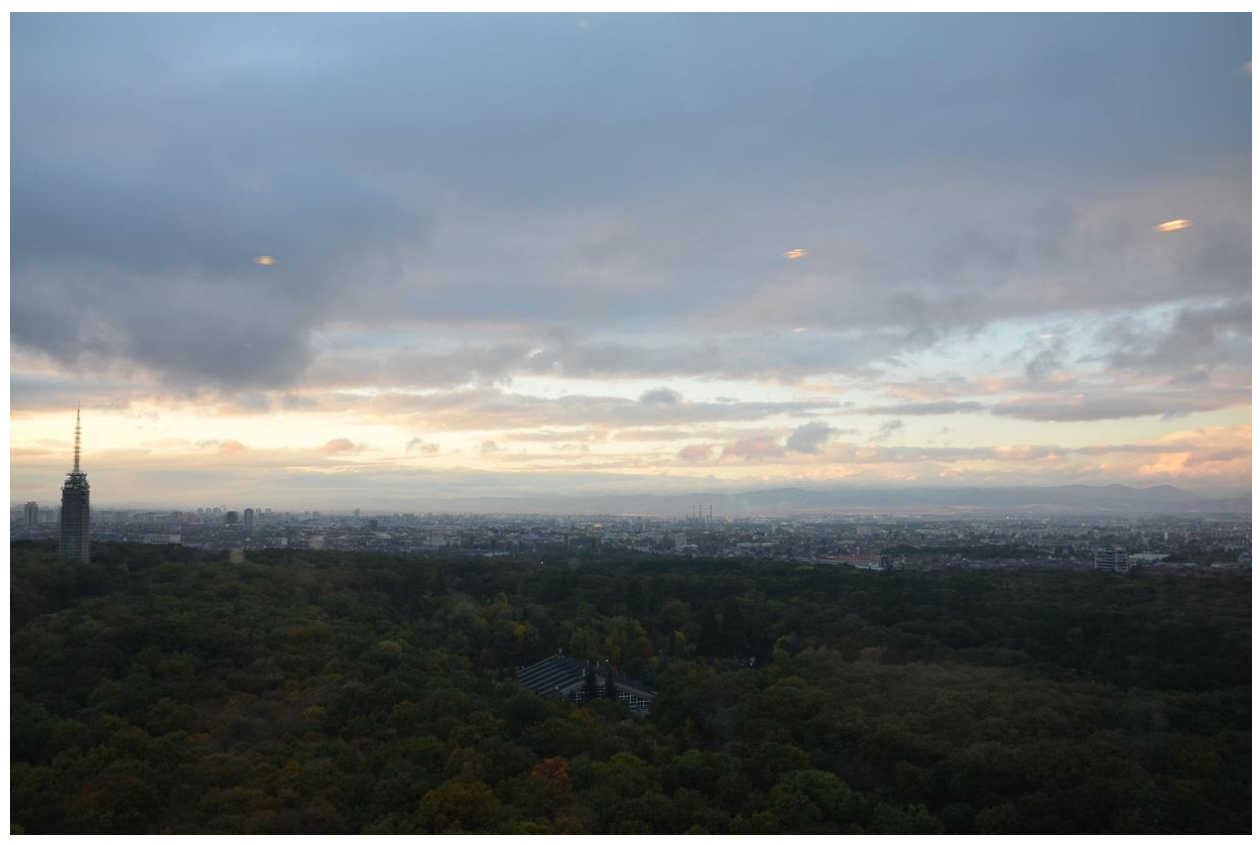
Panoramic view of Sofia city from restaurant "Panorama"