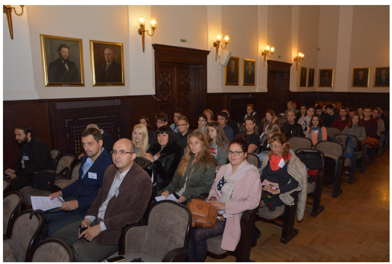
Conference attendees, students from Sofia University and pupils from First English Language School