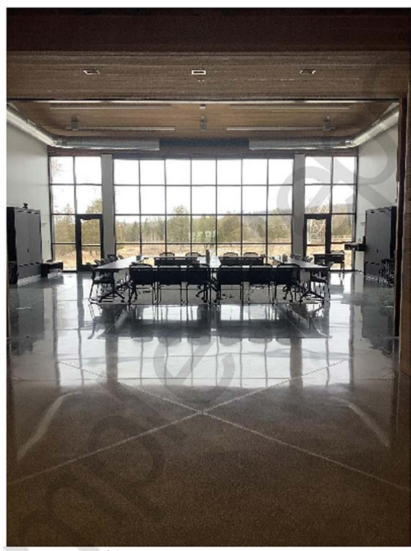
b) Plant facing 340 degrees

the degree values are actually coming from pulldata function!