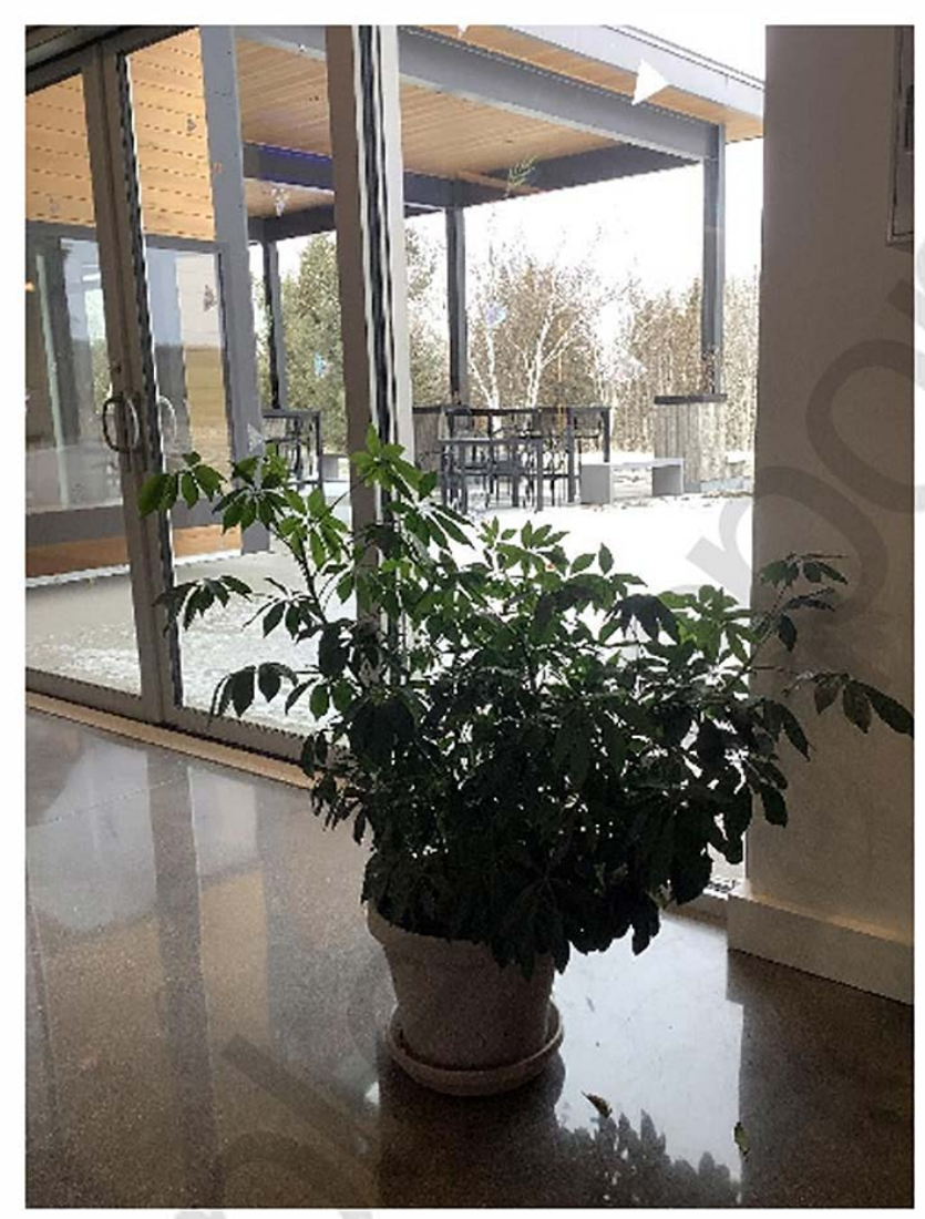
c) Merch facing 258 degrees