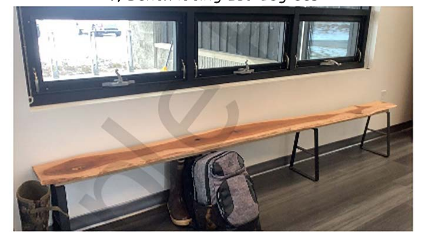
b) Bench facing 189 degrees