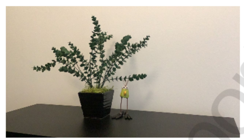
c) Plants facing 29 degrees