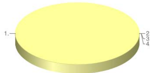
Pie Chart Percentage Values: